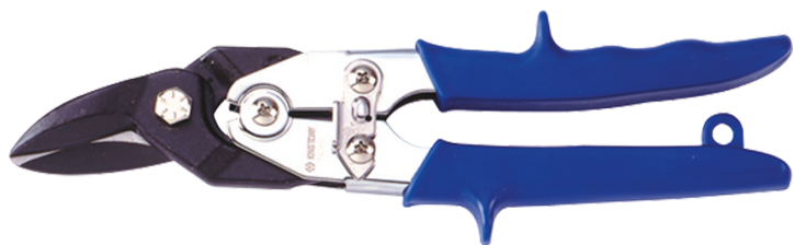
Figure tin snips