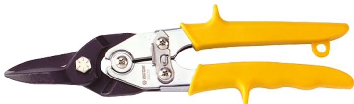
Figure tin snips