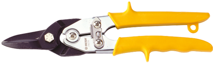
Figure tin snips