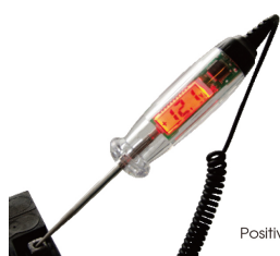
Positive (+) polarity