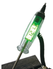
Negative (-) polarity