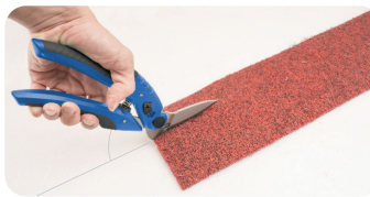
•Big angle design between blades and the handles of the scissors