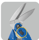
•Small angle of blades