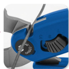
•Iron wire cutter