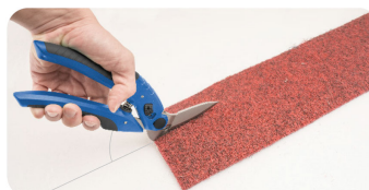
•Big angle design between blades and the handles of the scissors