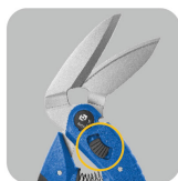
•Small angle of blades