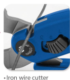
• Iron wire cutter