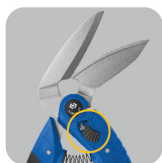
•Large angle of blades