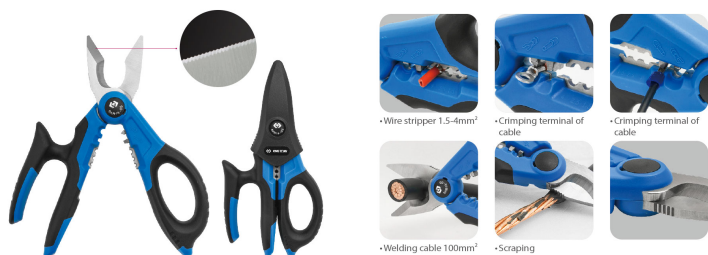
•Wire stripper 1.5-4mm 2