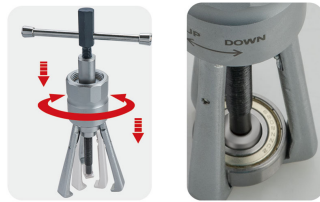
• Adjust the jaws by turning the screw