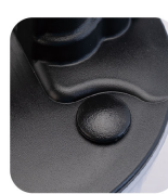
• Safety valve