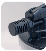
• New Silencer