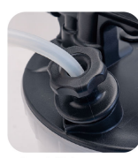
• Special joints are easy to connect