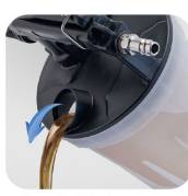
• Pour fluid hole