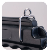
• Handle trigger with lock