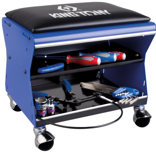
Mobile work chair 1 tray